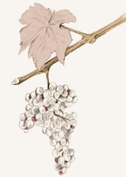
Red Grenache Syrah

Young wines packing plenty of fruit and fresher primary aromas and substantial body. An enthusiastic youthfulness is what this line of wine embodies