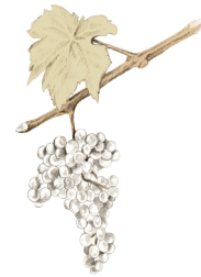
White Grenache Macabeu

Young wines packing plenty of fruit and fresher primary aromas and substantial body. An enthusiastic youthfulness is what this line of wine embodies