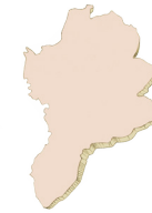
Vilalba del Arcs D.O. Terra Alta Non-irrigated Sustainable